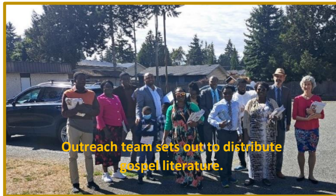
Outreach team sets out to distribute gospel literature.

Our love of Christ for our neighborhoods was demonstrated in the third quarter of 2023 as our