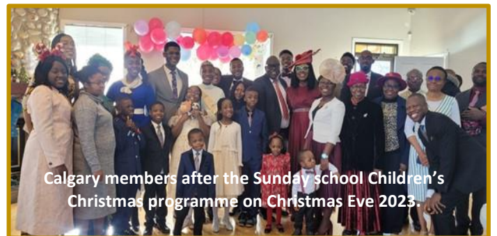
Calgary members after the Sunday school Children's Christmas programme on Christmas Eve 2023.

Bible verses. We enjoyed the playlet on the theme "Joy to the World!" which focused on the story of the Birth of Jesus Christ. The children recited verses from Luke 1:26-28 and Luke 2:9-11 and sang many Christmas songs. It was a very wonderful time of fellowship and an opportunity to reflect on the special gift that God sent to humankind, Jesus Christ.